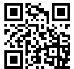
Scan to Subscribe Only

P.S. For more details on our 2023-24 season, continue to the next page.